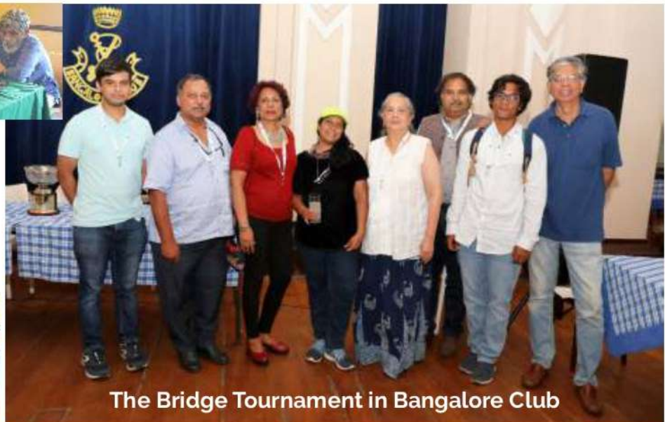
The Bridge Tournament in Bangalore Club