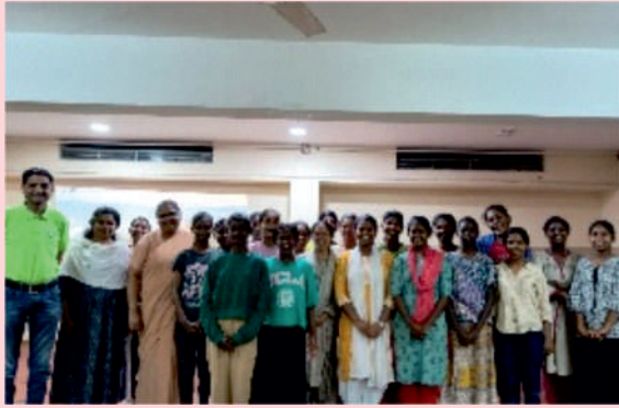
Sneha Nilaya: Session held - 12th September 2025 for 28 children.