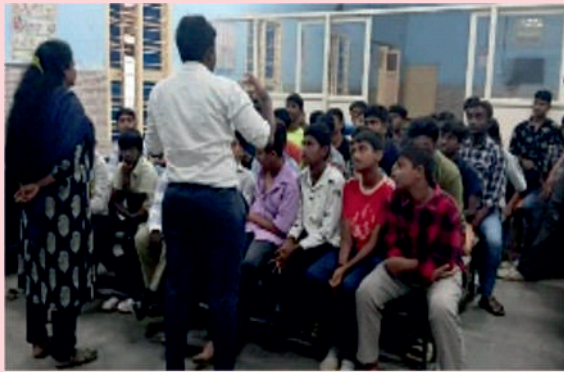
St. Mary's Boys: Session 1 held- 24th October 2025 for 45 children.