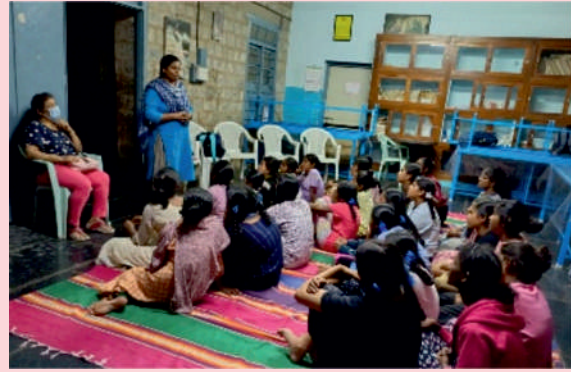
St. Charles: Session held - 31st October 2025 for 27 children.