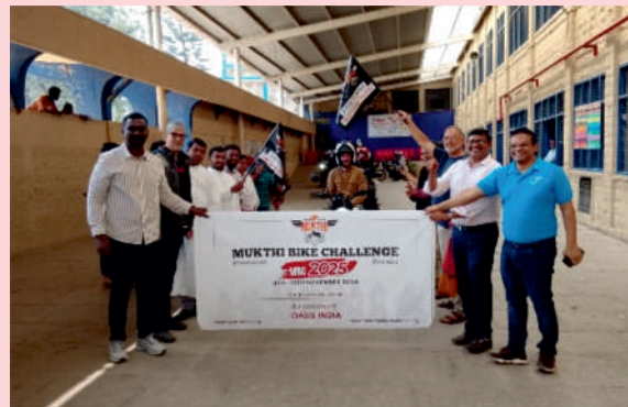
Mukti Bike Challenge