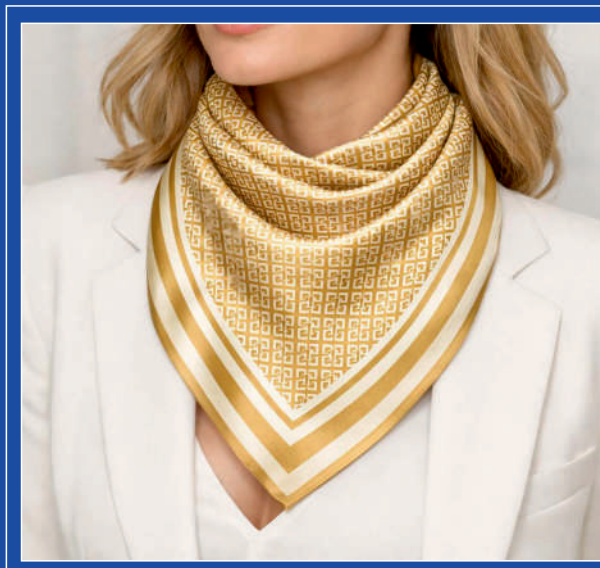
Scarf + Brooch Pin ₹300