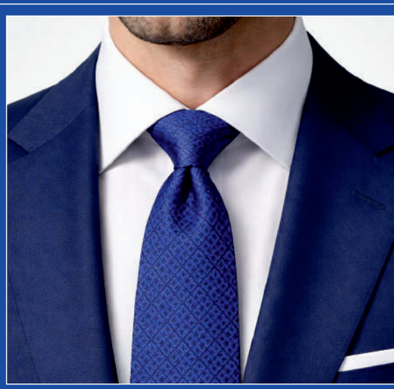
Tie + Pocket Square + Cufflinks ₹850

Talk to our front desk staff for assistance