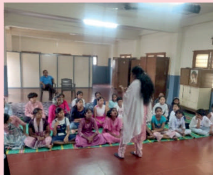
RTC: Session 1 held - 29th August 2025 for 29 children.