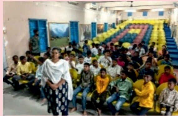
St. Mary's Boys: Session 2 held- 9th January 2026 for 55 children.