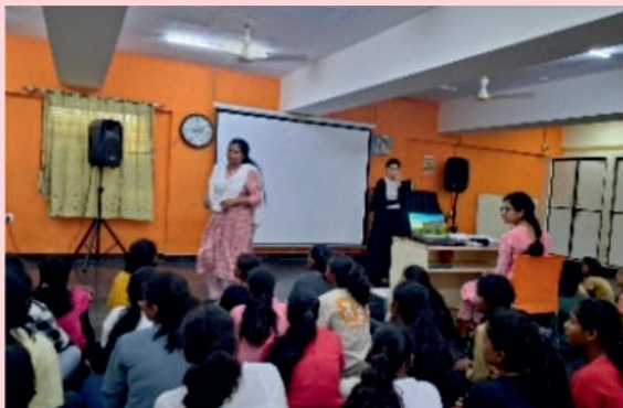
Reaching Hands: Session held - 23rd November 2025 for 50 children.