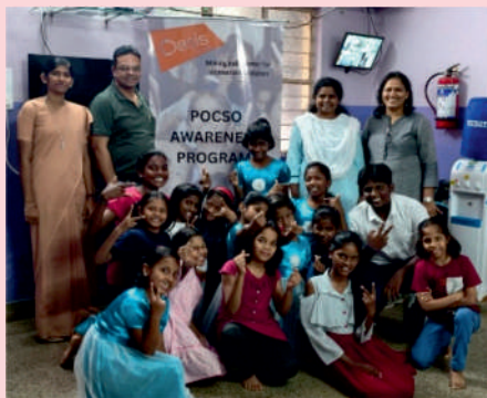
Chaitanya: Session held - 14th August 2025 for 15 children.