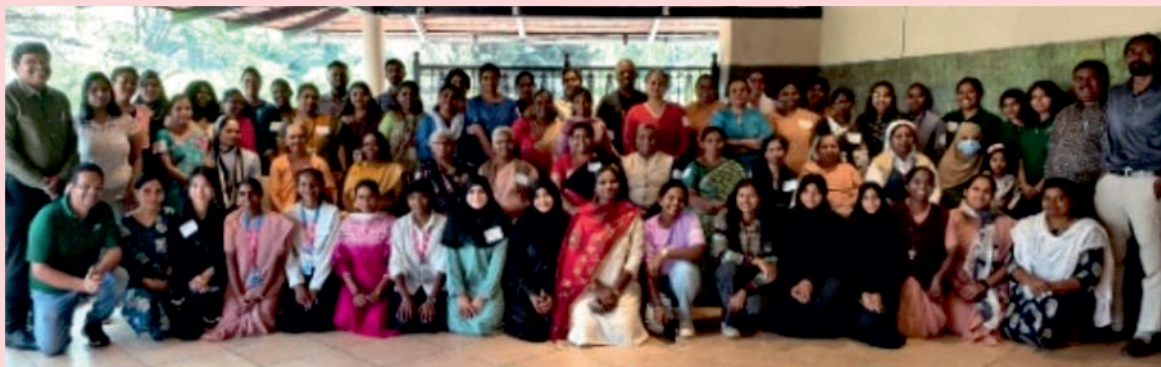
Workshop on Digital Trafficking and Child Safety - 21st February 2026