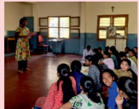
RTC: Session 2 held - 5th September 2025 for 49 children.